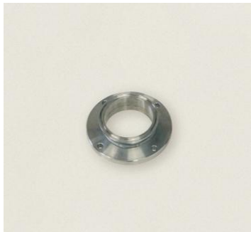
RCA adapter for replacements

If you need to replace an old refractometer series ASR / AMCR there is a mounting adapter