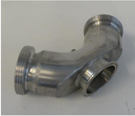
FLCA series for angular installing