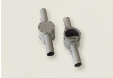
LCAA series for pipe installing

There are three types of flow cells with different diameters and different types of connection: