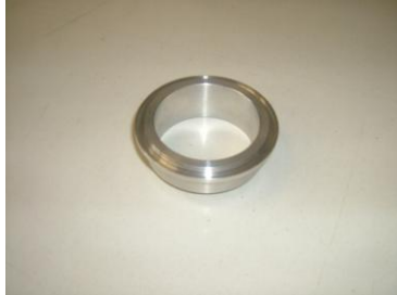
BCA series for tank or boule installing

For the application on tank or boule is provided an adapter for connecting the container-refractometer.